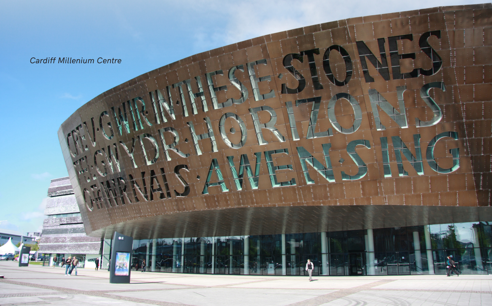
Cardiff Millenium Centre

The UK is bursting with famous cities. Historic cities such as Bath and Chester have magnificent ruins and make for pleasant trips. Manchester, Brighton, Bristol and Newcastle to name but a few are cosmopolitan and modern cities which have a world famous nightlife as well as thriving cultural scenes. Alternatively you might like to visit Liverpool, the home town of the Beatles and the European City of Culture 2008. The capital cities of London and Edinburgh are not to be missed on a visit to the UK, and if you visit it is recommended that you stay for several days.