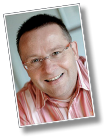
Head of Academy