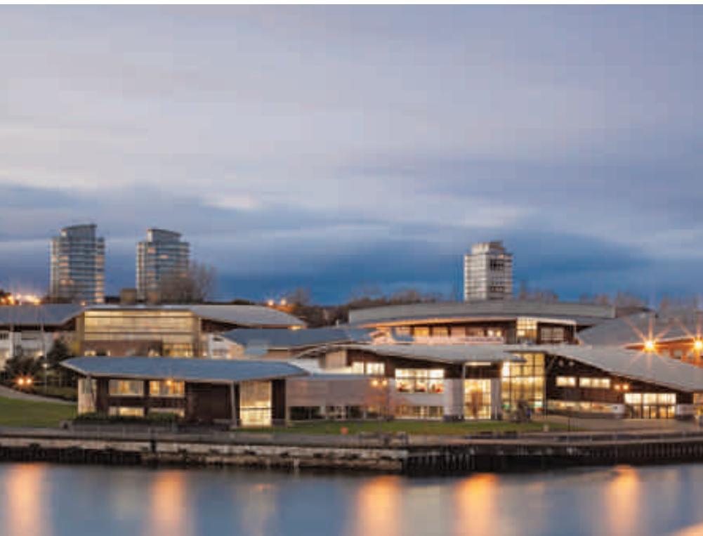
Sir Tom Cowie Campus at St Peter's