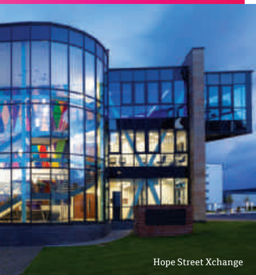
Hope Street Xchange