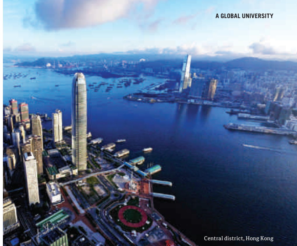
Central district, Hong Kong

As an international student in Sunderland, you'll be in good company. We have one of the largest overseas student populations in the UK, so you'll be learning alongside students from over 100 countries. We've delivered the same high-quality courses offered at Sunderland through our international partners across the world for decades. Your international perspective will help enrich the learning experience for others, and you'll benefit too from the diversity of the students around you.