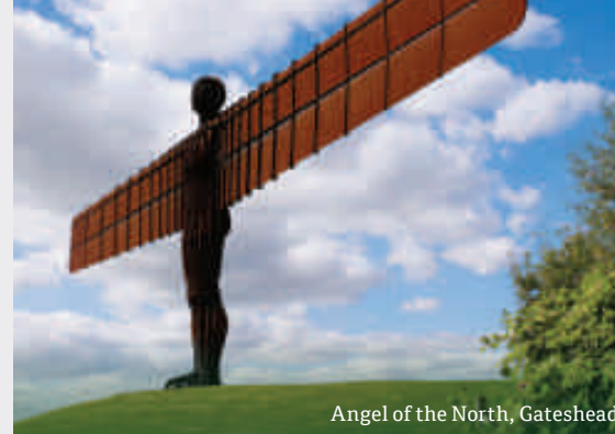
Angel of the North, Gateshead