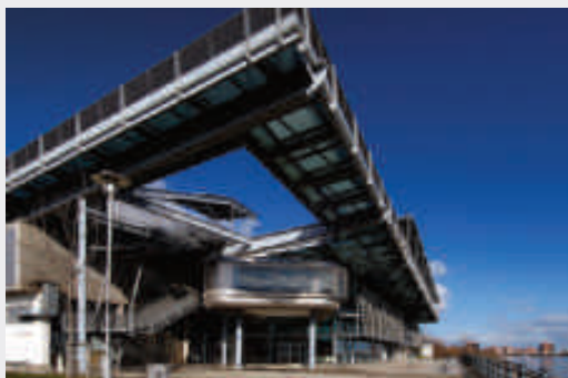
National Glass Centre

Our cultural heart. Discover the Northern Gallery for Contemporary Art at the National Glass Centre.